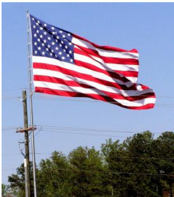
Post 307 Honors Automationdirect for their Patriotism and support of 307 Americanism