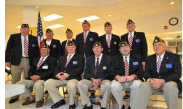
OFFICERS FOR THE YEAR 2009-2010