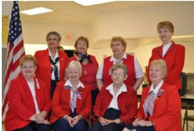
Officers for 2009-2010

Speaking of programs, we are scheduled to work at the Christmas Shop at the Atlanta Veteran's Hospital on December 8 th . We have taken proceeds from the Poppy solicitation and bought gifts for the hospitalized Veterans and their family members. If you have not helped at the hospital before, then make it a must this year. You can be a personal shopper to help the Veteran select gifts, wheel them down to the Christmas Shop, or be a gift wrapper for the presents they select. When you see tears in their eyes or the